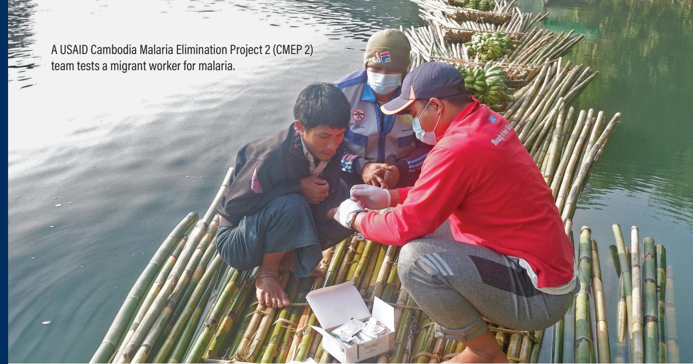
A USAID Cambodia Malaria Elimination Project 2 (CMEP 2) team tests a migrant worker for malaria.

URC is a recognized leader in the global fight against infectious diseases. We support ministries of health, private health providers, local and international organizations and communities to strengthen responses to existing and emerging infectious disease threats. Together, we target community level prevention and screening efforts, sub-national level efforts with district leaders and providers to strengthen quality service delivery, and national-level efforts to strengthen coordinated responses. We partner with local and community-based organizations to ensure services reach marginalized populations.