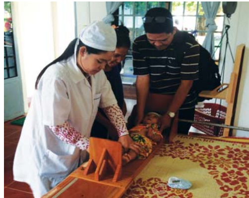
A mother helps as the referral hospital staff and government supervisor screen her child

At the service delivery level, URC's research found that most hospitals did not have any systems to address malnourishment in children who were admitted for acute illness. Under the USAID BHS Project, URC supported the National Nutrition Program (NNP) to develop National Guidelines on Management of Acute Malnutrition . We also worked with the NNP and three leading hospitals to develop a Clinical Practice Guideline (CPG) for treatment of Severe Acute Malnutrition (SAM) in hospitals. The first CPG on treatment of malnutrition in children for Cambodia was accepted in 2012 as part of the Pediatric CPGs.