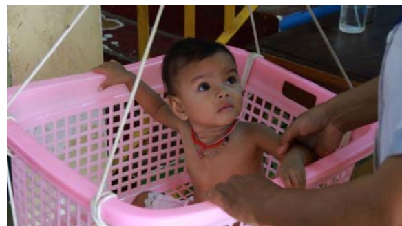
Screening for malnutrition at Battambang Hospital

Under the QHS Project, URC focused on strengthening health center capacity to provide SAM screening and referrals in outpatient department (OPD) and integrated management of childhood illnesses services for children under five years of age and growth monitoring and promotion (GMP) in children under two years of age. Key strategies include health center quality improvement (HCQI) which involves on-site coaching, use of competency checklists, and tracking progress as well as Pediatric Coordination Alliance Team (PCAT) meetings that bring together health workers providing pediatric care at the different levels (see brief: Transforming the Health Workforce ). URC worked with the NNP to develop a new GMP register for health centers which facilitated tracking nutrition indicators. We also developed a GMP booklet, instructional video, and GMP/SAM screening posters. One simple innovation developed to support GMP was basket scales. These have made weighing babies easier and much safer.